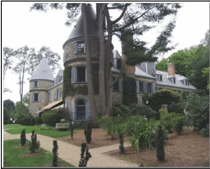
Grey Towers