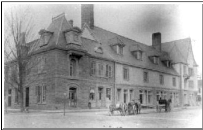
Forester’s Hall

The traditional central business district was listed on the National Register in 1998 following a detailed study and application to the National Park Service prepared by Taylor and Taylor Associates of Brookville, PA under contract to the Historic Preservation Trust of Pike County, Inc.. The application states: No particular architectural style, date, or method of construction predominates in any single part of the district. The district’s overall character is that of an architecturally-cohesive business district of a mid-to-late-nineteenth century resort community-county seat, containing a mixture of commercial architecture – including hotels – interspersed with residences and governmental and religious institutional buildings. The overall cohesion of the district is created by its dense development and by a general lack of significant concentrations of intrusions. The District includes some fifty-five contributing historic resources, five buildings previously listed on the National Register, and fourteen non-contributing buildings.