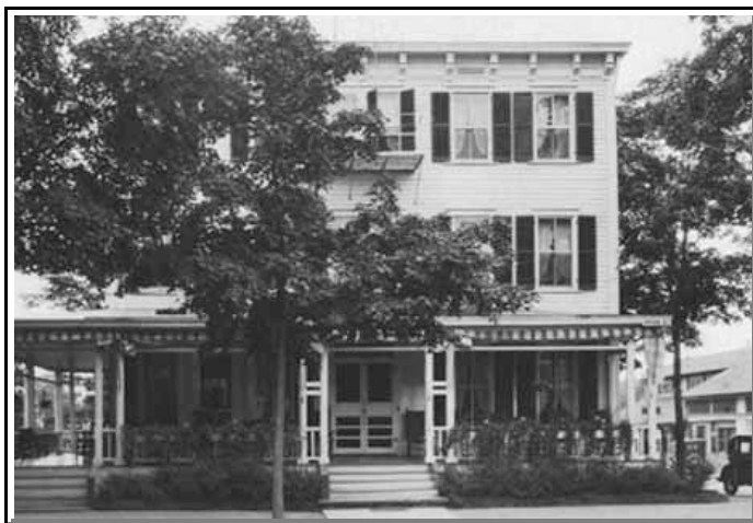
Hotel Fauchere

The traditional central business district was listed on the National Register in 1998 following a detailed study and application to the National Park Service prepared by Taylor and Taylor Associates of Brookville, PA under contract to the Historic Preservation Trust of Pike County, Inc.. The application states: No particular architectural style, date, or method of construction predominates in any single part of the district. The district’s overall character is that of an architecturally-cohesive business district of a mid-to-late-nineteenth century resort community-county seat, containing a mixture of commercial architecture – including hotels – interspersed with residences and governmental and religious institutional buildings. The overall cohesion of the district is created by its dense development and by a general lack of significant concentrations of intrusions. The District includes some fifty-five contributing historic resources, five buildings previously listed on the National Register, and fourteen non-contributing buildings.